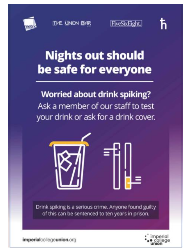
Posted in Union Venues October 27